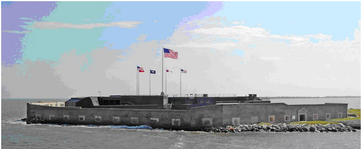
Fort Sumter

A lot is discussed about Fort Sumter in the Charleston Harbor on April 12, 1861. For me this says it all. A foreign government (United States of America) was holding a fort (military presence) with in the boundary of a sovereign country (Confederate States of America) . This facility was situated with the potential to block commerce into the sovereign country (C. S. A.) and could have been used to collect tribute in the guise of tariffs to their foreign country (USA) from the incoming commerce as promised by Lincoln's inauguration address. The foreign government (USA) would not turn over the facility to the sovereign country in which it was situated. and turned down an offer to "sell" the property. Instead they launched a fleet to reinforce the fort, an act of war.