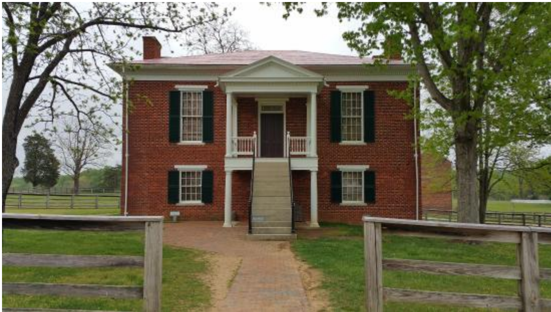
Appomattix Courthouse

Very respectfully, Your obedient servant, R.E. Lee General